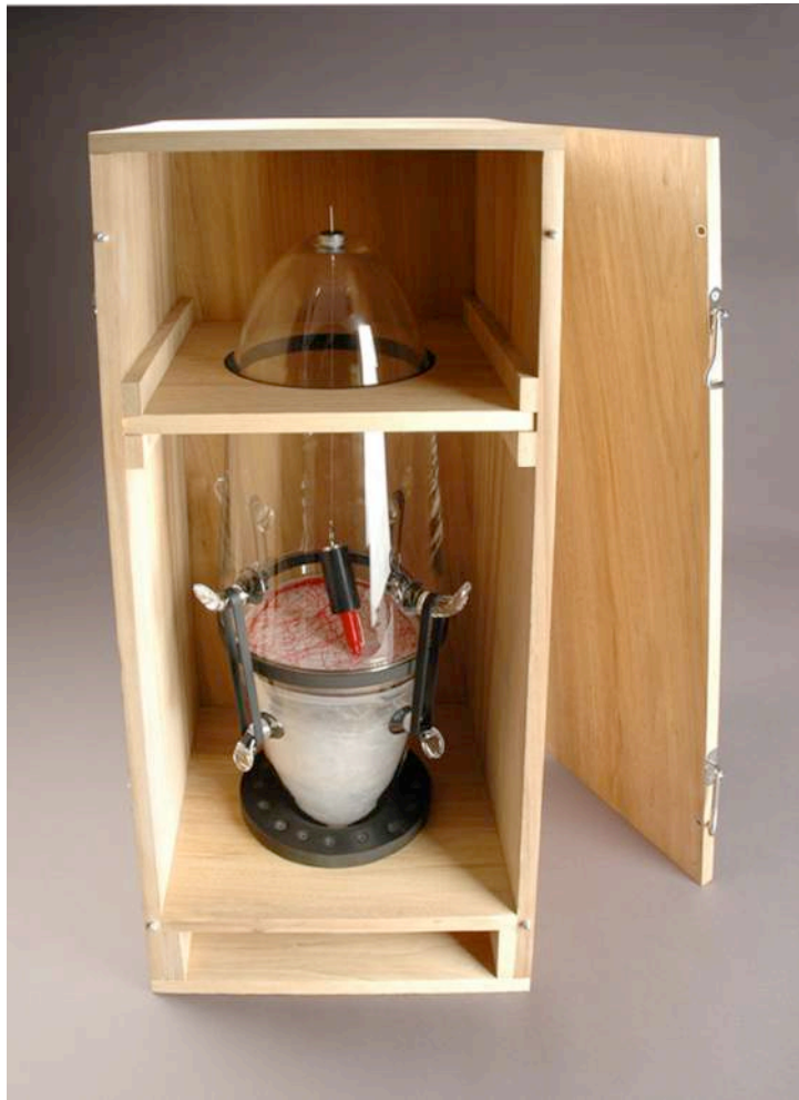
Water Drawing Instrument by David Shingler, 2005 glass, mixed media