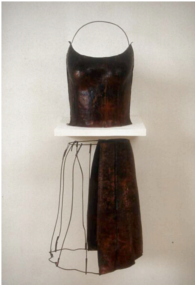
Line Dress by Felicia Szorad, 2004 copper