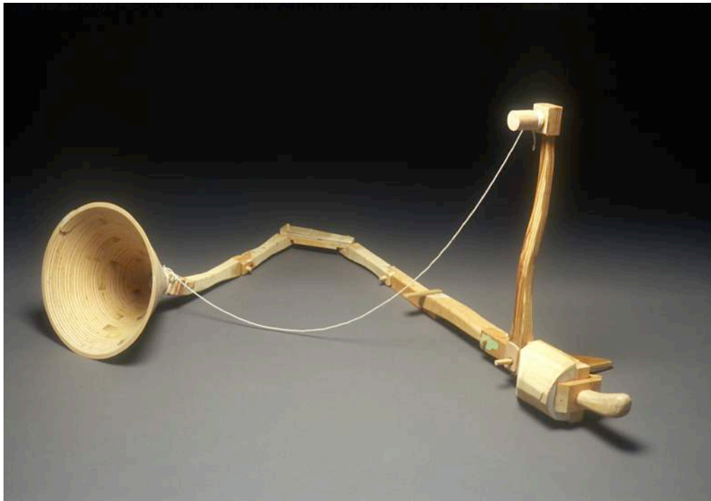
Bill's H.C.T. by Travis Townsend, 2005 wood, mixed media