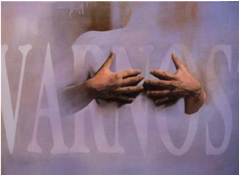
NeStvarnost (detail), 1999, oil on linen, 30x60"