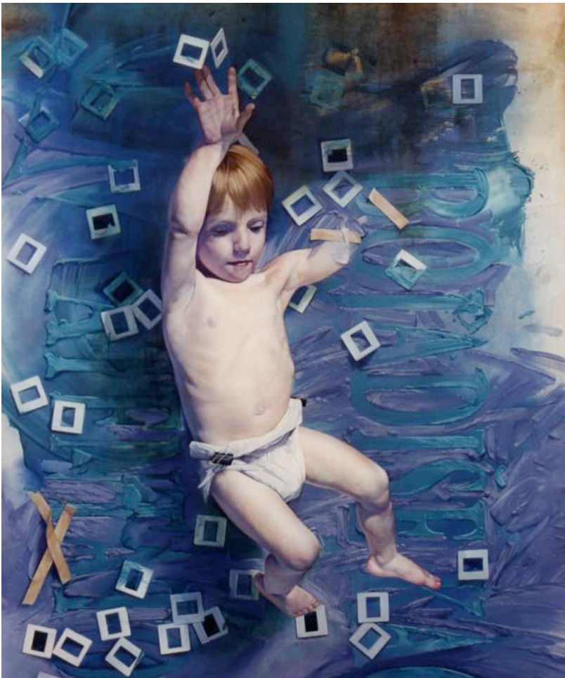
Coloring as an Assassin (detail), 2001, oil on linen, 62x50"