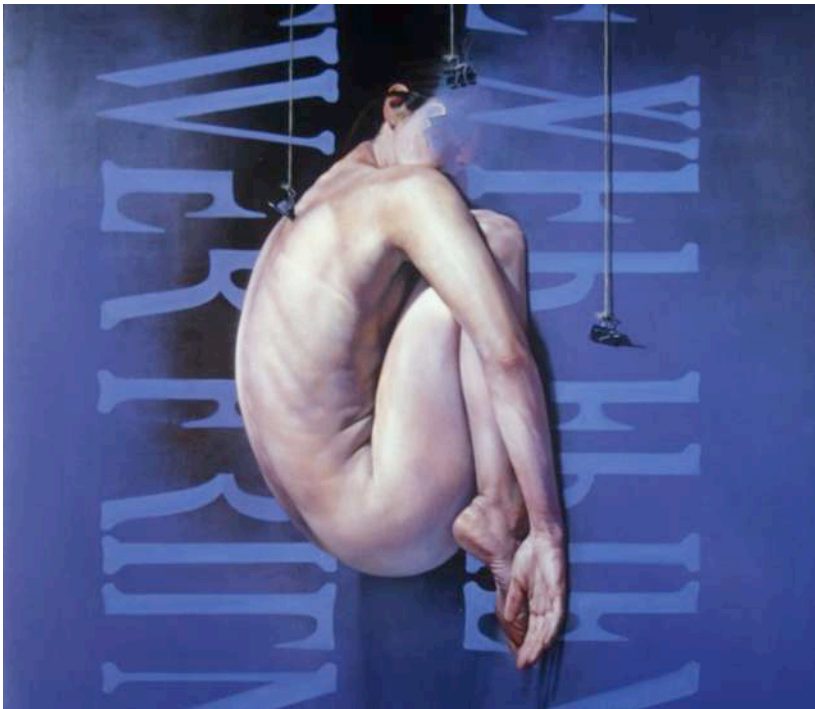
Viewer Friendly (detail), 2000, oil on linen, 48x72" Private Collection