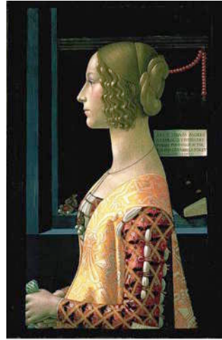
Giovanna Tornabouni , Domenico Ghirlandaio, 1488

Art has always been a reflection of culture. Historians, archaeologists, you name it, people have always studied art to learn more about a society's culture! Manifest Gallery's Gender, Engendered show features a multitude of diverse student works to bring to you the thought of today and tomorrow!